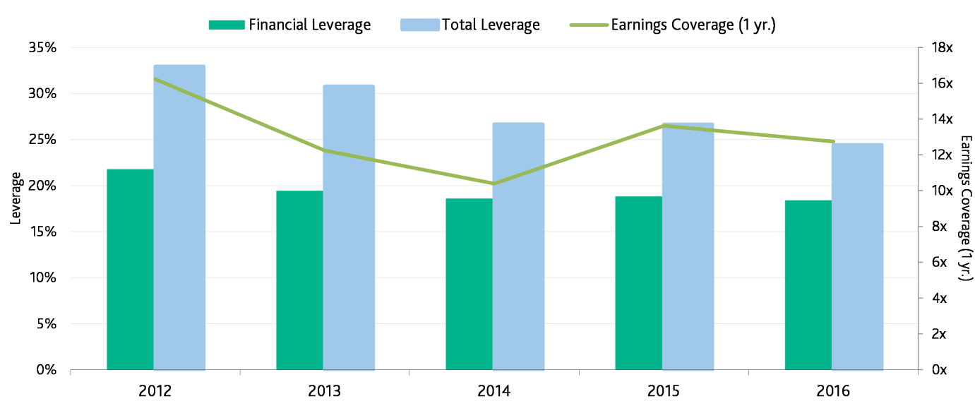
Exhibit 3 Financial Flexibility

The Group's financial flexibility continues to be enhanced by its very good and frequent access to capital markets, illustrated by the innovative issuances of pre-funded off-balance sheet contingent capital facilities, that total $2.7bn as of July 2017, including a recent $750m facility issued in July 2017.